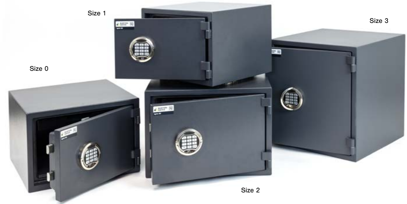
Ignis S2 - Family Range