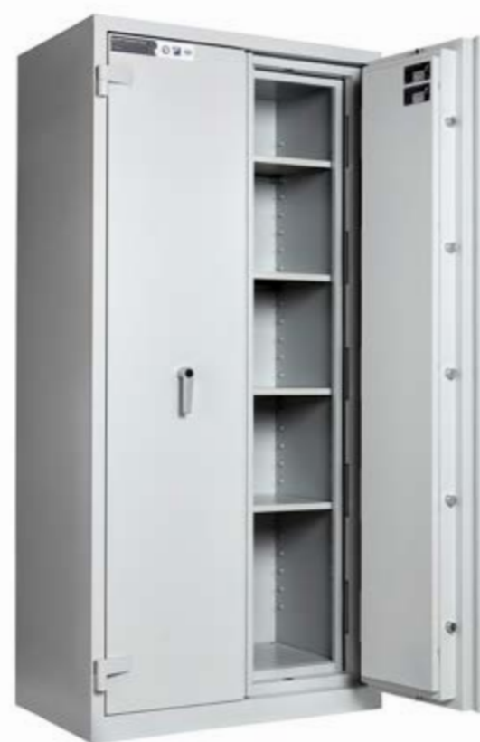
Firesec 4/60 XL