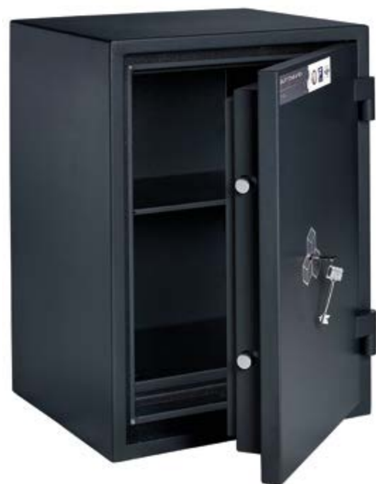
Firesec 4/60 Large