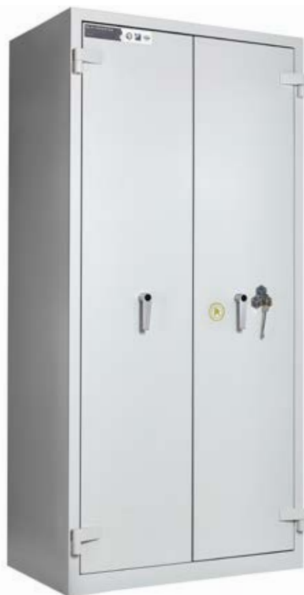
Firesec 4/60 XL

Add 20mm to external depth for handle, hinges and electronic lock on Large model and 55mm for XL model